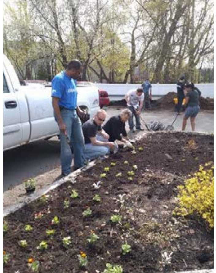
Volunteers from Harris RF beautifying the grounds on the Day of Caring.