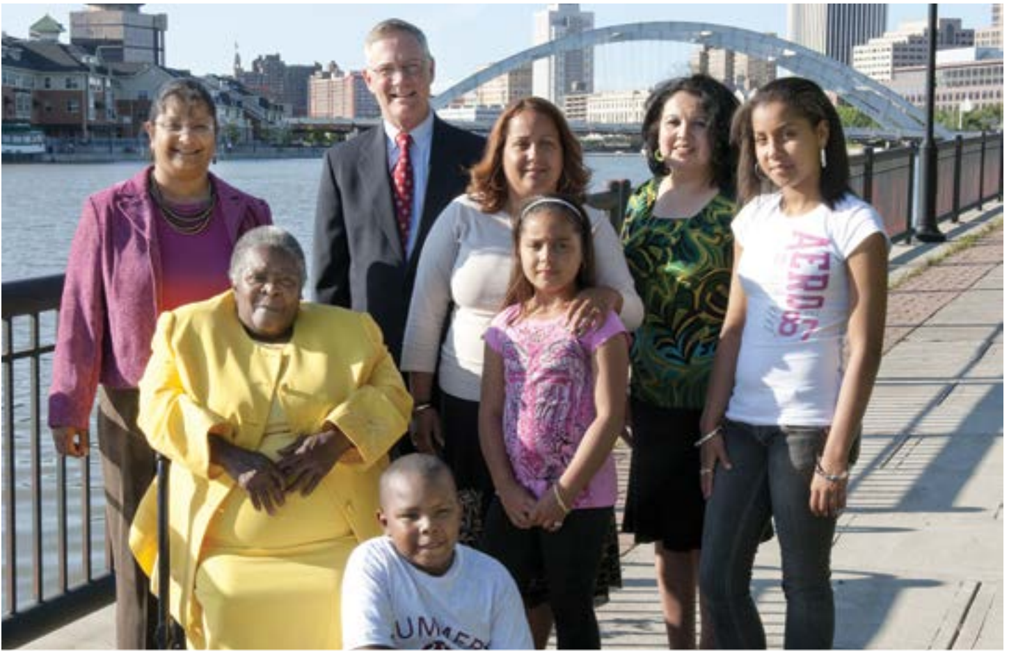
The Community Place brings together people of all ages from all walks of life united in one common goal—to improve the quality of life of all Monroe County residents—by providing programs and services that teach, encourage and maintain self responsibility and civic pride.