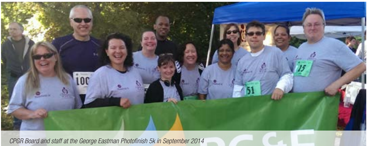
CPGR Board and staff at the George Eastman Photofinish 5k in September 2014