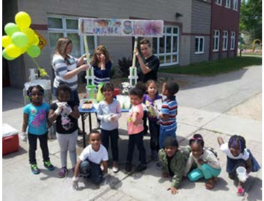
Our youngest entrepreneurs, 4 year olds in our pre-K class operate their own business.